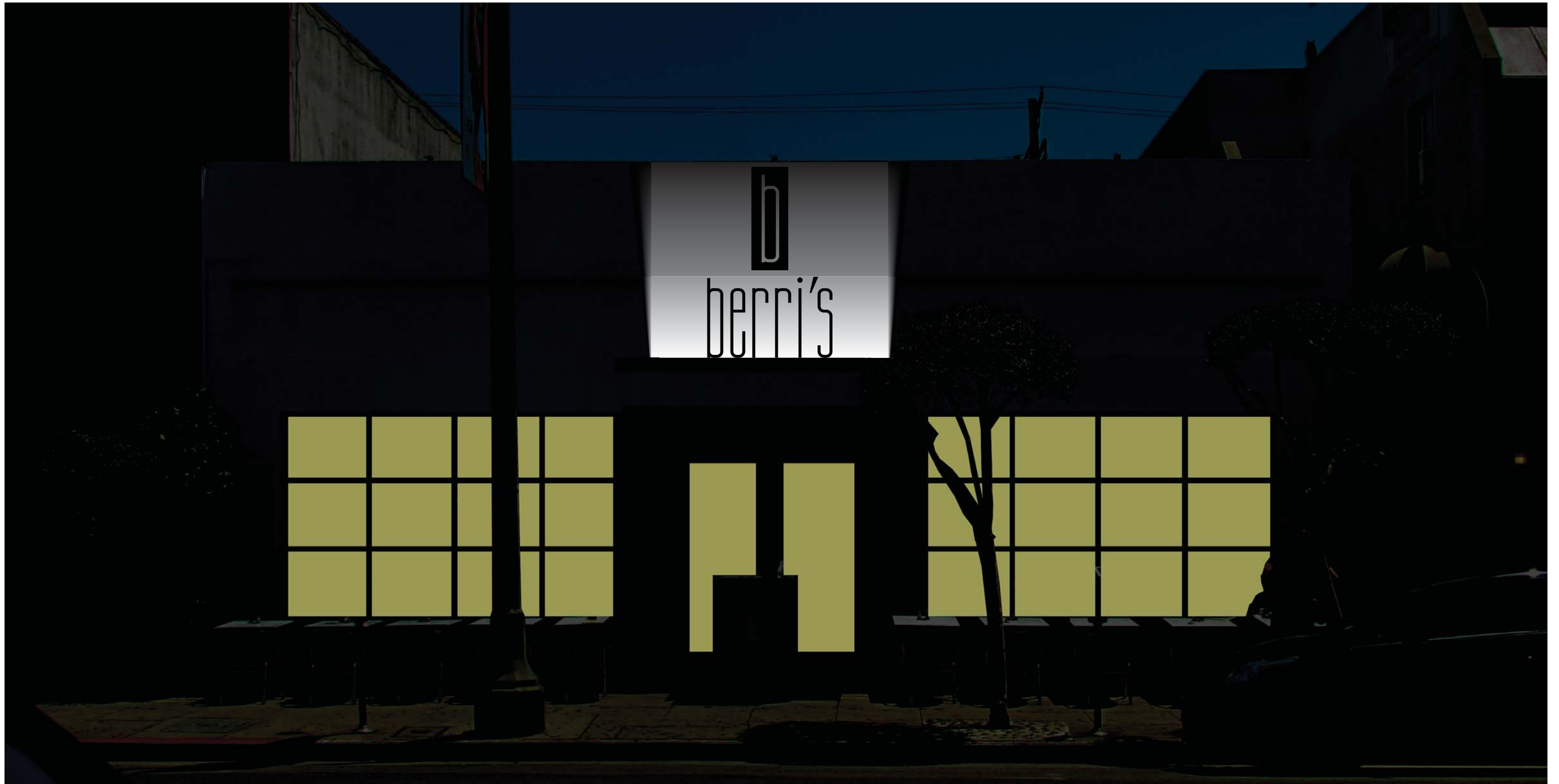
Simulated Nighttime Concept