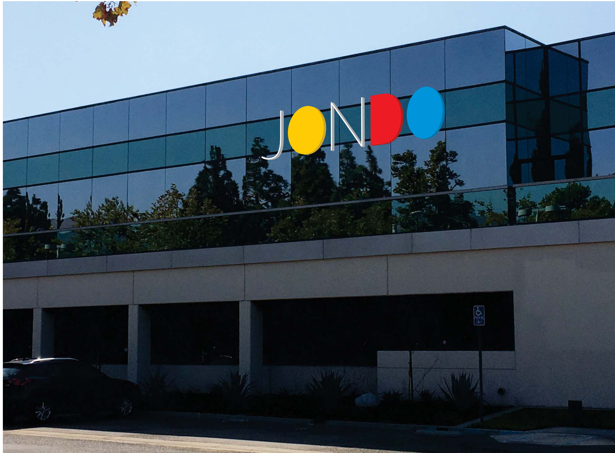
Oblique View of 5" Deep Dimensional Letters (Simulated)