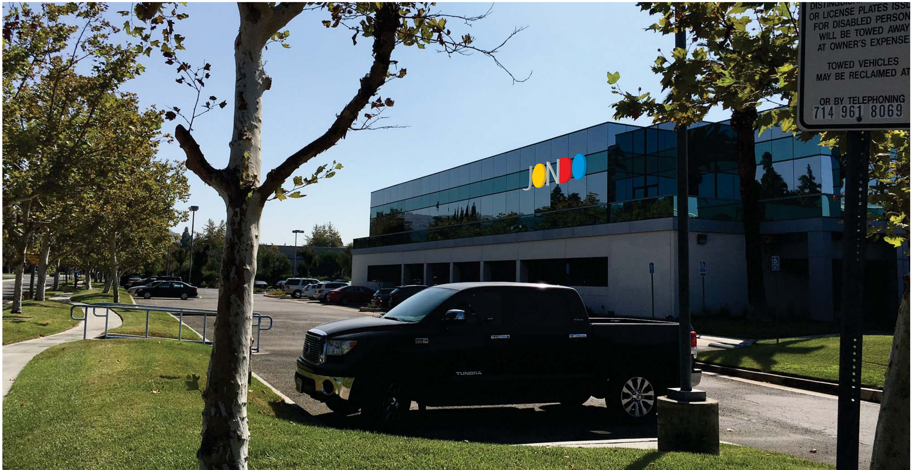
Distant Oblique View of 5" Deep Dimensional Letters (Simulated)