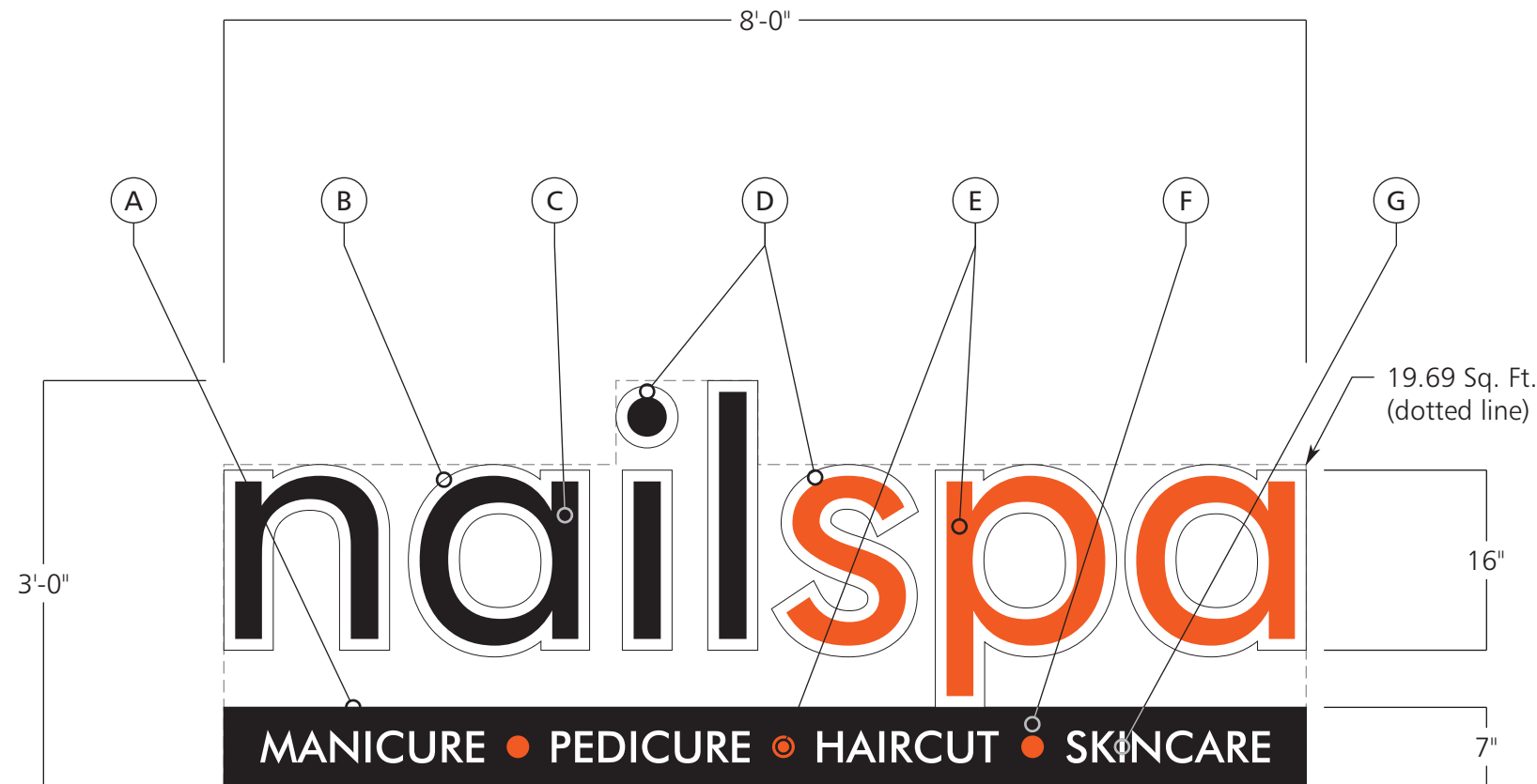
New LED Internally Illuminated Channel Letters